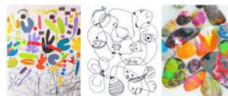
Favorite Art Activities for Children

Chester Ronning - In January we are focusing on the children's favourite activities by letting each child have a special day. Check the parent calendar for when your child's day will be. Each child was asked what they wanted to see on their day. Some would like to bring a show and tell, (no animals) some planned the craft and gym activity, and some planned cool theme days. We encourage our parents to participate by helping their child prepare for their day and joining in the activities, when possible helping your child present, or sending pictures that explain something specific.